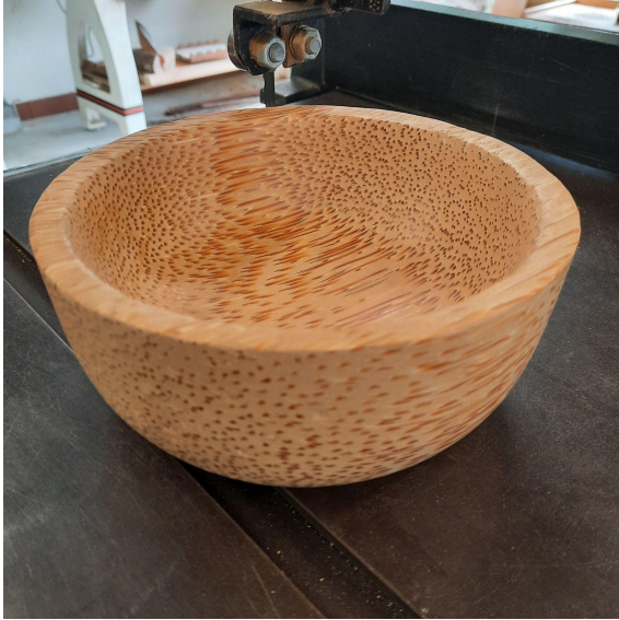
GARY'S PALM WOOD BOWL- VERY UNUSUAL GRAIN.