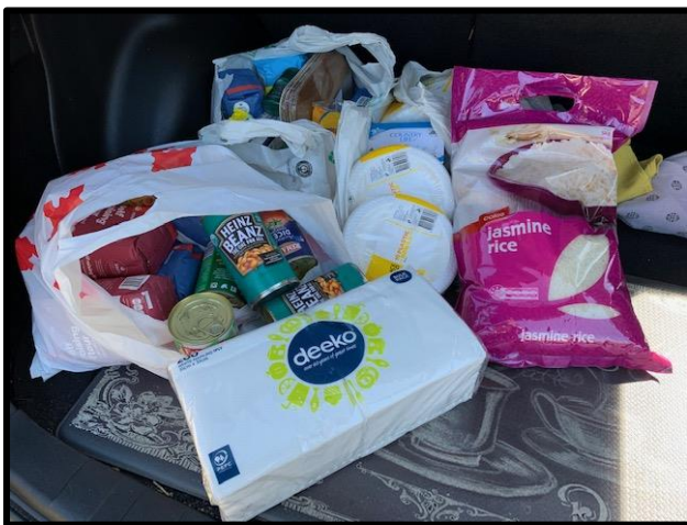
Donations taken to Blair Athol on 27 th August. Greatly appreciated.

PROVERBS 21: v13 'If you shut your ears to the cry of the poor, you too will cry out and not be answered' (v.13).